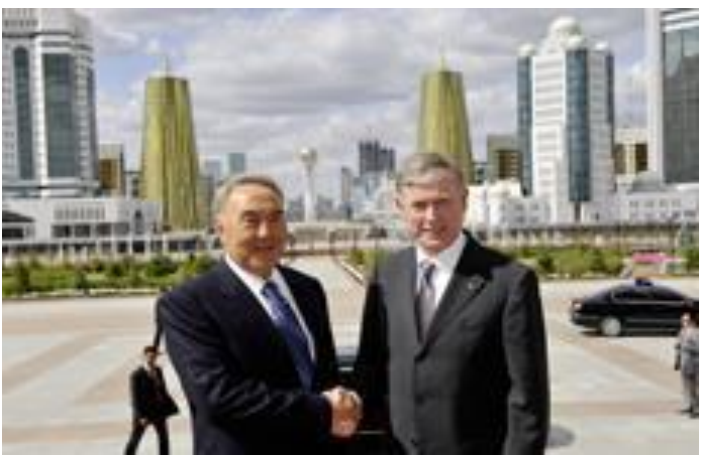
The Heads of State in front of the landmark of Kazakhstan in Astana